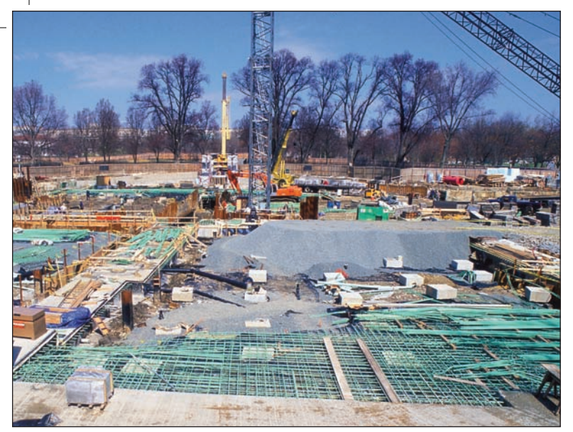
The memorial structures themselves are granite—selected for its strength, hardness, and water resistance.