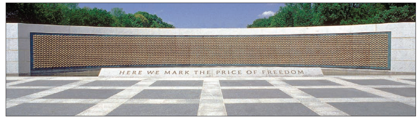
The Freedom Wall's low stone coping is carved with the words, "Here we mark the price of freedom." The wall has 4048 sculpted, gold-plated, stainless steel stars mounted on 23 bronze panels. Each star represents 100 American deaths during the war.

electrophoretic finish for wear resistance. After completion of plating, each star was tested using X-ray fluorescence to confirm the gold plating's thickness.