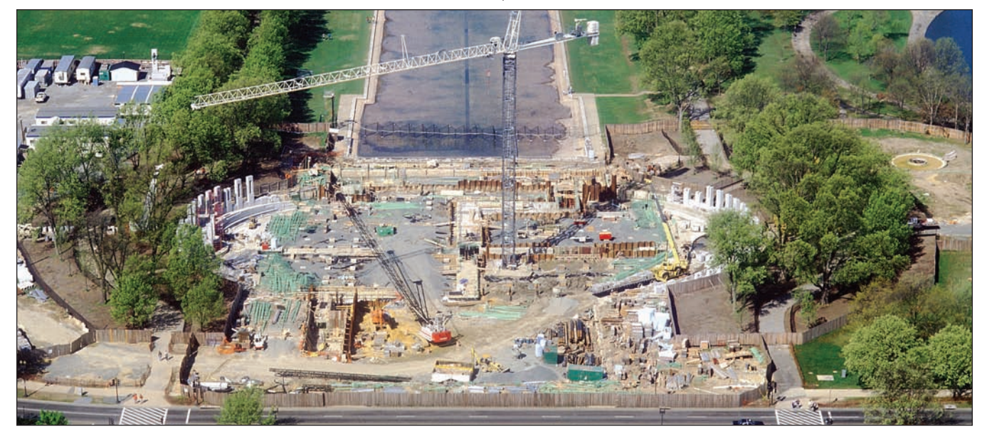
While the stonework and ornamental metal specification sections were the most intricate to coordinate, the memorial's unique conditions also meant other challenges, ranging from demolition and soil conditions to waterproofing.

workmanship—these were the first portions of in-place work to be installed, and served as a standard by which subsequent work was judged.