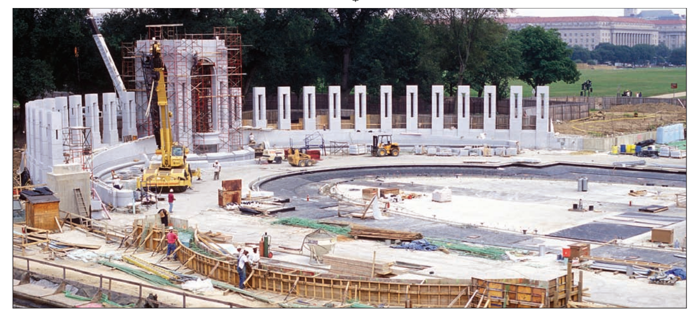
Given its location between the Washington Monument and the Lincoln Memorial, there were concerns the National World War II Memorial would interrupt the area's sightlines. As such, the central portion was lowered 1.8 m (6 ft) below its previous grade.

"Here we mark the price of freedom." The wall consists of 4048 sculpted, gold-plated, stainless steel stars mounted on 23 bronze panels, each star representing 100 American deaths during World War II (symbolic of the gold star displayed in the windows of families who had lost a member in the war). So as not to create the impression of undifferentiated deaths, there are seven subtly different star designs, each randomly rotated by a few degrees. There