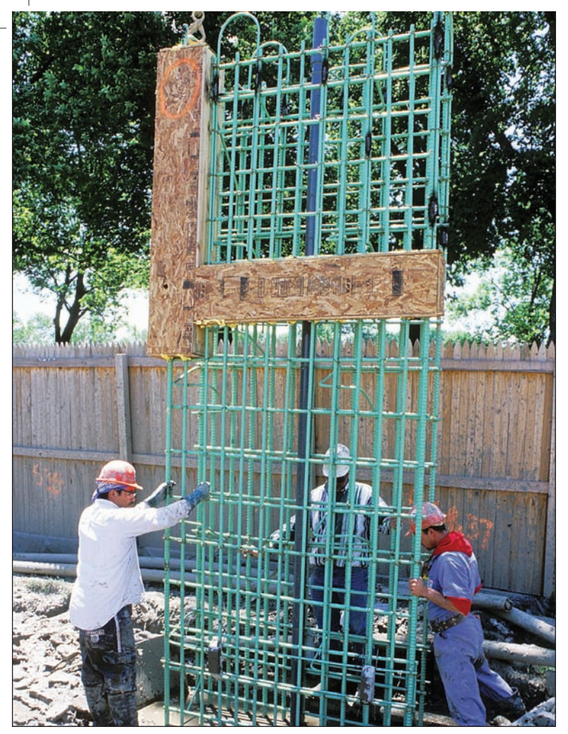
Workers lower the reinforcing cage for the slurry wall. The green color of the bars indicate their epoxy coating.

John Stevens Shop—a stone carver under separate contract with the government. The stonework specifications described the necessary responsibility and coordination procedures as follows: